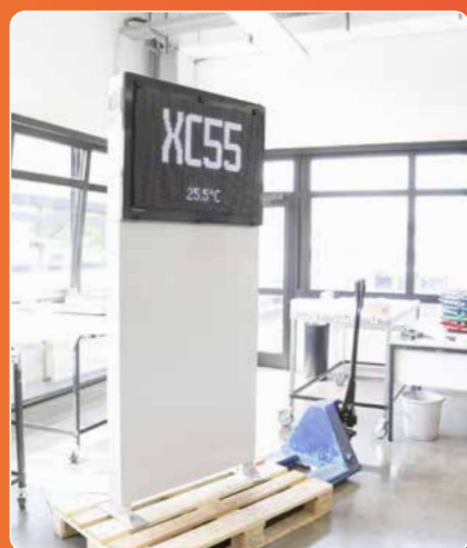
Stand system: 860 x 2000 x 110 mm